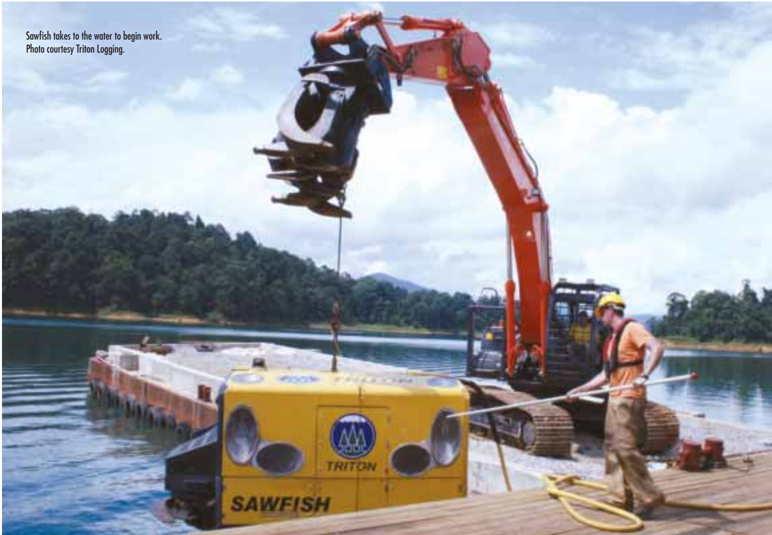
Sawfish takes to the water to begin work.

guides the robotic submarine to a tree, where it latches onto the tree with pinchers. An airbag is then attached to the tree using a drill. Once cut, the airbag is deployed, bringing the log to the surface for capture and transport.